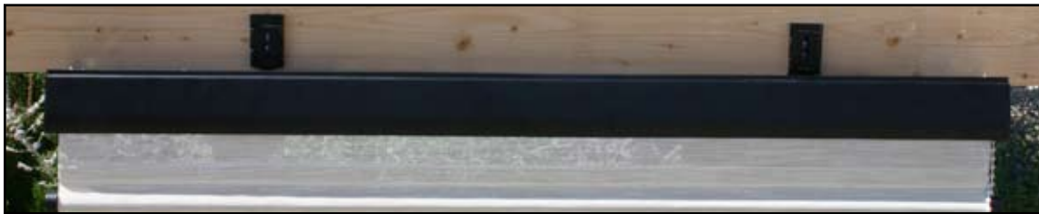
Fig D (wall installation shown)

We recommend installing your brackets on the closest stud to each end of shade, allowing at least 2 inches (5.08 cm) from each end..